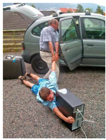
Are you hooked to your computer?